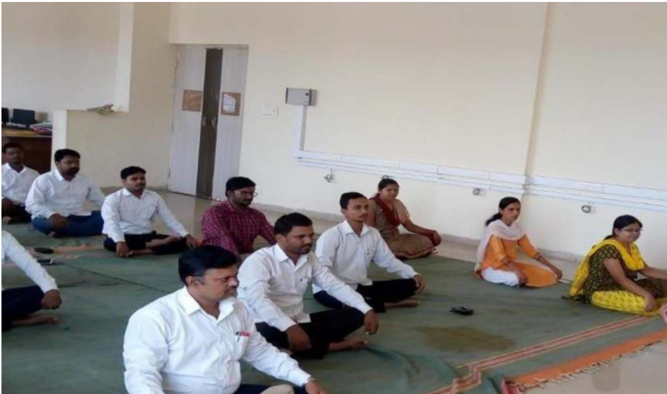
All Faculty and Student celebrate Yoga Day( 07/06/2022)