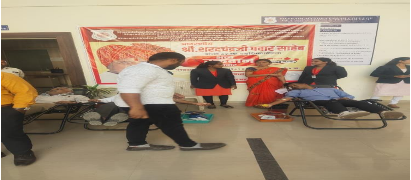
Blood Donation Camp(27/12/22)