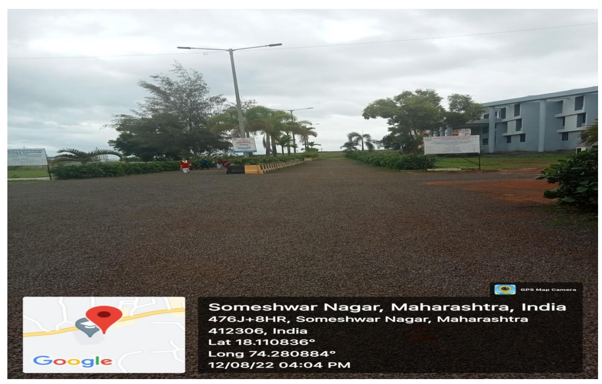
3. Pedestrian Friendly pathways