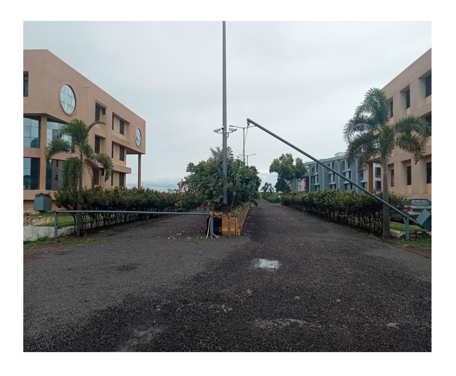
1.Restricted entry of automobiles