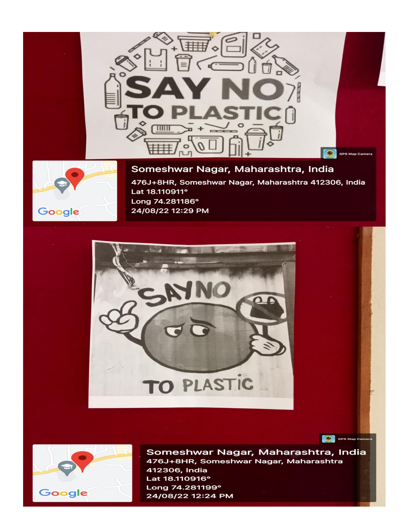
Say no to the plastic / plastic ban