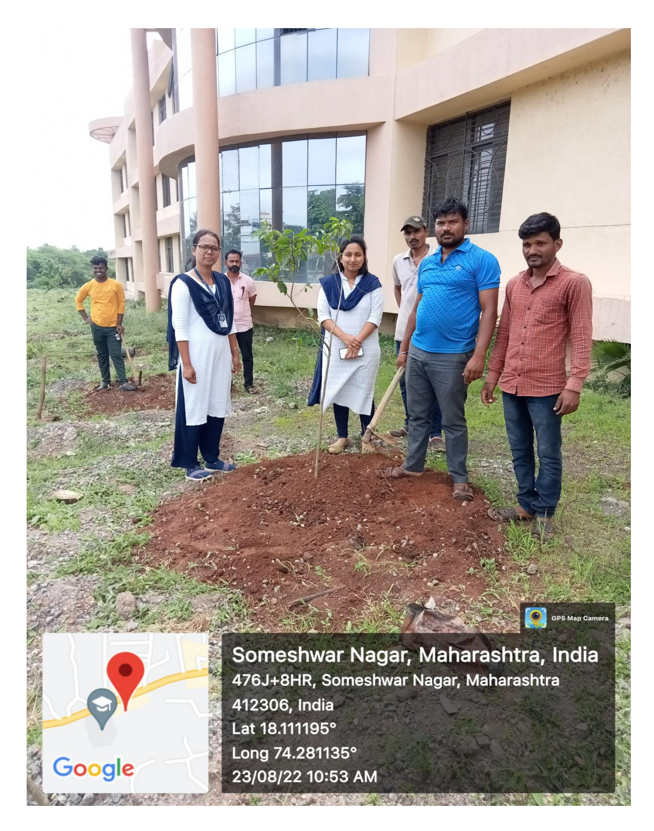
5.landscaping with trees and plants